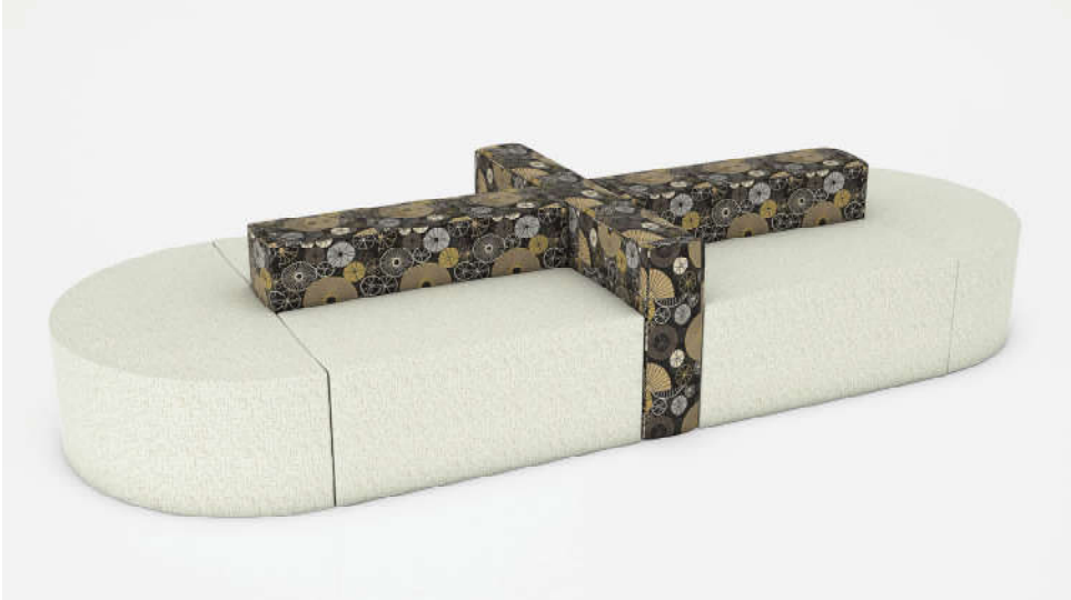
Quadrant C Configuration